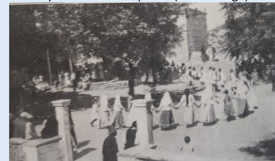
15 August at the old Central Square

On the day of the Assumption of Virgin Mary, the Karyates gathered at Aghios Andreas square to celebrate after the service at the church of the Assumption at the ancient planes was over.