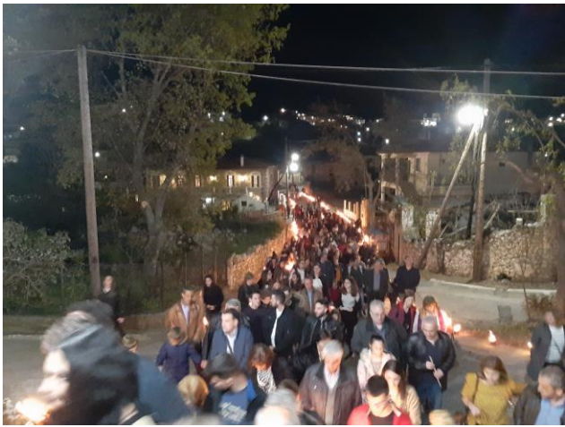
The Epitaph arrives at the Church of Aghia Paraskevi

The Resurrection Liturgy was attended by many people at the Holy Church of Aghia Paraskevi. The Resurrection of Jesus Christ was celebrated at the beautiful courtyard of the church, where the worshippers exchanged "Christos Anesti" wishes and enjoyed a spectacle of impressive fireworks in the night sky.