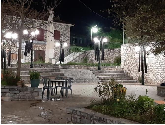
The Central square adorned with black ribbons

The spring weather contributed to a big turnout of visitors in Karyes this year. Along with many Karyates who live in Athens and other cities in Greece, many visitors selected this beautiful village of Parnonas to spend the holy days of Easter, filling up the hotels for the season.