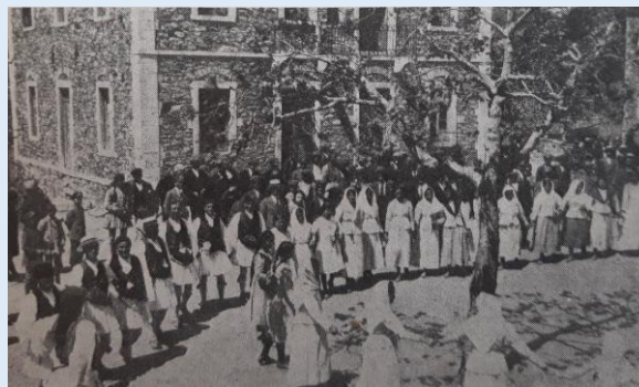
Easter Tuesday at the "Rachi Square"