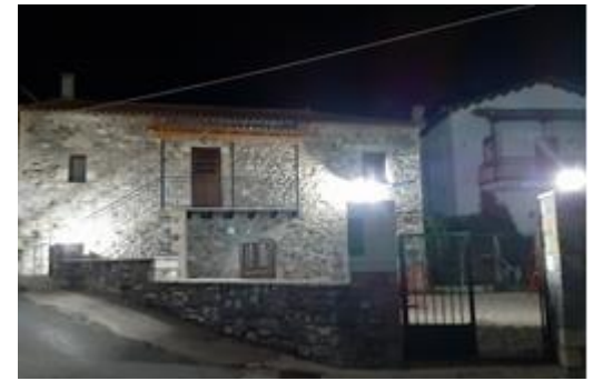
The "Karyatis Sports Club" and "Karyes Cultural Club" building