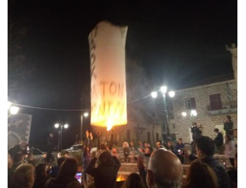
At the night of the last Sunday of “Apokries” at the Central Square