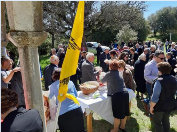
The members of the Church/Ecclesiastical Council share traditional treats

Despite the fact that a feast was not organized this year, many families had made their own arrangements for barbeque picnics under the shade of the trees and enjoyed their time until late in the afternoon.