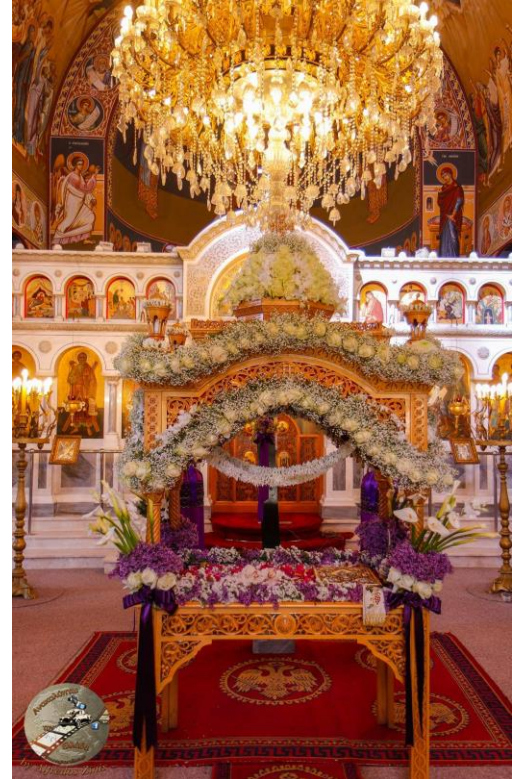
The beautiful Epitaph

The members of the Ecclesiastical Council and the Cultural Club had taken care both of the impressive decoration of the Epitaph and the decoration of the path with grand lights that created a "luminous path of devoutness."