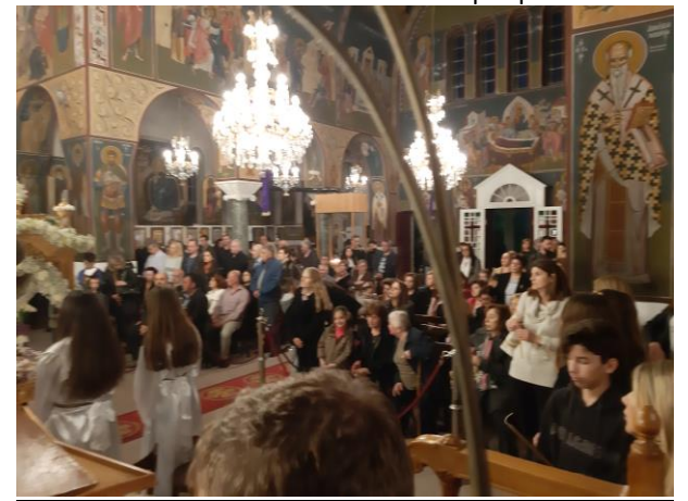
Moments from the Good Friday's Divine Liturgy in the St. Andrew Church